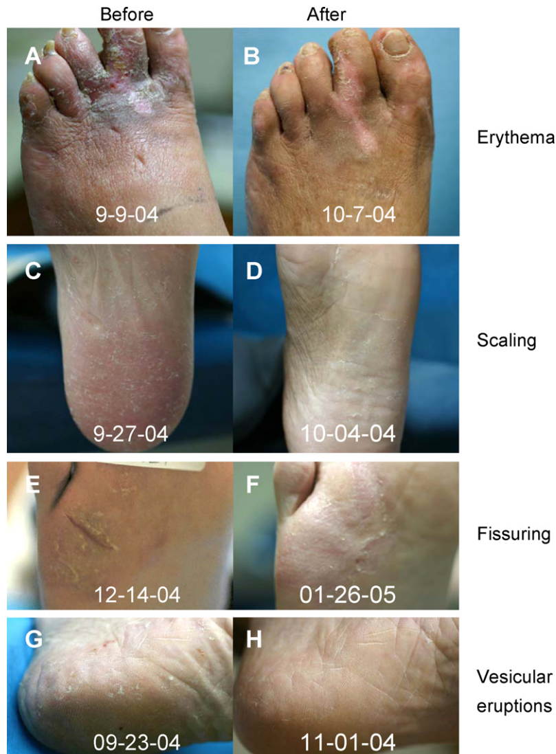
Fig. 2. Resolution of erythema (A and B), scaling (C and D), fissuring (E and F) and vesicular eruptions (G and H) following the usage of the copper-oxide containing socks. The panels for each patient are pictures taken before (A, C, E, and G) and after using the copper-oxide containing socks (B, D, F and H).