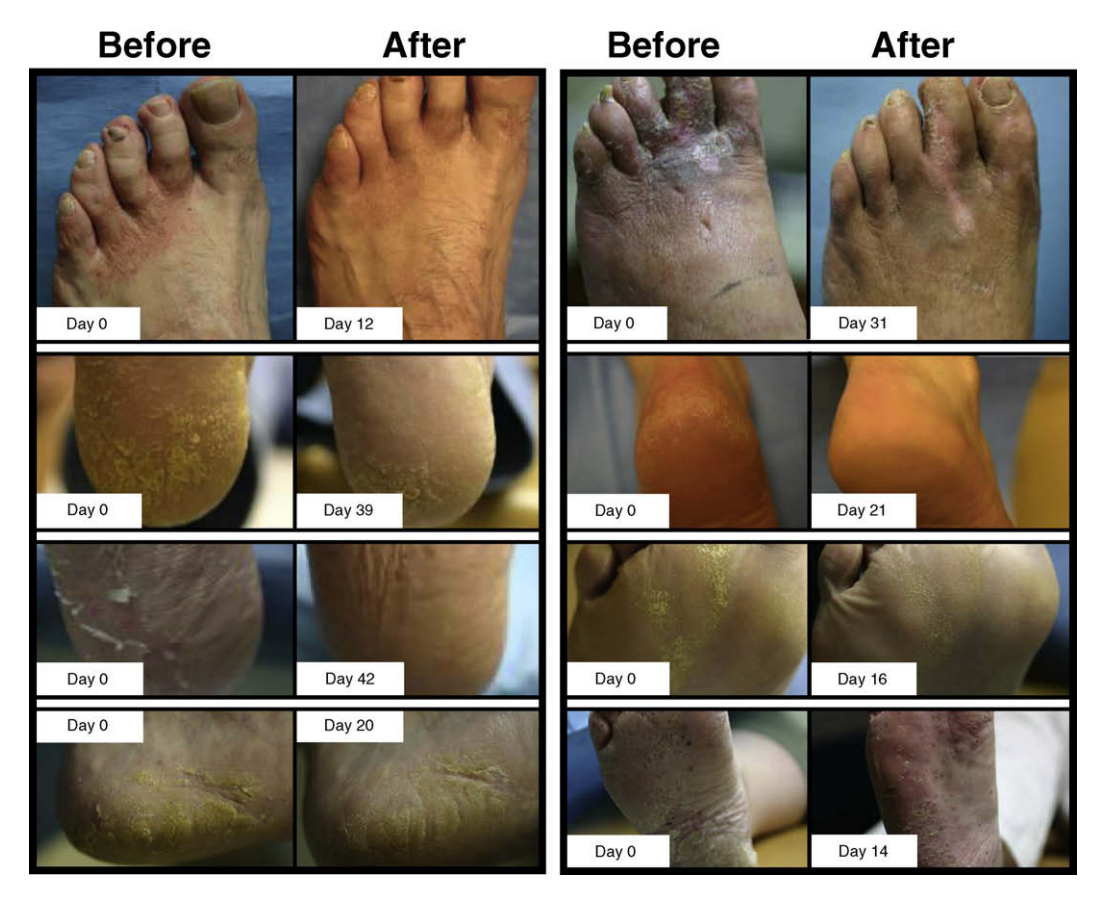
Fig. 1. Resolution or improvement of tinea pedis infections following the usage of the copper-oxide containing socks.

As stated, copper is an essential trace element involved in numerous human physiological and metabolic processes [10], including skin formation [22,23] and wound repair [24], as may be seen in the following examples. Several copper dependant enzymes and polysaccharides, such as lysyl oxidase, metalloproteinases, glycosaminoglycans and small proteoglycans, needed for cell