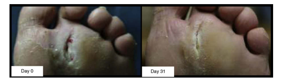
Fig. 2. Wound closure following the usage of copper-oxide containing socks.

proliferation, re-epithelization and extracellular matrix protein crosslinking, including of collagen, elastin and fibronectin, require copper as a cofactor [23,25,26]. The copper dependant superoxide dismutase enzyme, important in protection against free radicals, is present in the skin [27]. Stabilization of fibronectin mats [28,29] and collagen crosslinking is increased by copper ions [30]. Copper modulates integrins expression by keratinocytes [31]. Topical copper sulphate treatment has been shown to accelerate epithelial tissue growth [32]. Furthermore, copper has been shown to stimulate angiogenesis [33] by inducing generation of vascular endothelial growth factor (VEGF) [32]. Human peptide Gly-(L-His)-(L-Lys) or GHK, which has a very high affinity for Cu<sup>2+</sup> and forms a GHK-Cu chelate, stimulates protein synthesis of collagen and elastin, angiogenesis and wound repair [22]. We also found that copper ions released in situ from wound dressings induced upregulation of many proangiogenic and other key factors involved in angiogenesis, skin regeneration and wound healing (manuscript submitted for publication). Importantly, the absorption of copper or copper oxide through skin has been demonstrated [18,34].